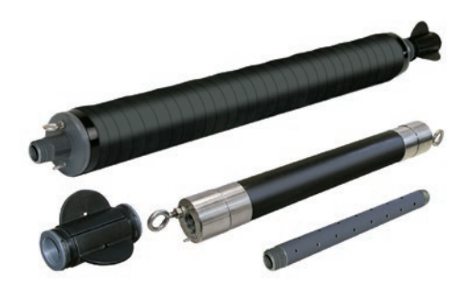
Model 800 Packers 3.9" and 1.8" (99 mm and 46 mm)

Model 800 Low-Pressure Packers can be used with Solinst Bladder Pumps to minimize purge times by reducing purge volumes. This reduces the cost of water disposal and labour. Packers are available in single point or straddle packer designs, and in sizes to fit 2" (50 mm) to 5" (127 mm) dia. wells. (See Model 800 Data Sheet.)