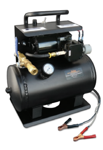
12 Volt Compressor

The compressor operates using 12 volt DC power source, such as a car or truck vehicle battery, and comes with alligator clips. The compressor operates at up to 125 psi and is equipped with a 2 US gallon (7.6 L) air tank which is rated to 150 psi.