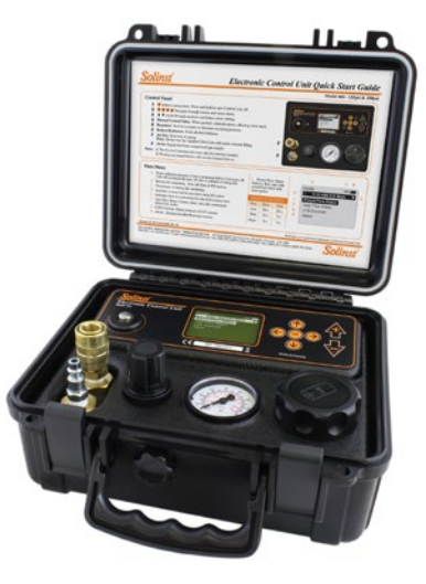
Model 464 Electronic Control Unit (125 psi and 250 psi Models)

The pump is quick to disassemble and the bladders and screens are simple to replace in the field. No tools required. Inexpensive polyethylene bladders can be quickly replaced to suit regulatory requirements.