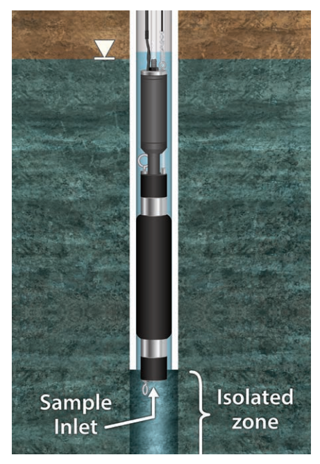
A Model 800M Packer can be used to isolate the sampling zone and reduce purge volumes.

Power Source: A 2.3 m (7.5 ft) power cord uses alligator clips to connect to almost any 12 volt DC power source that can supply at least 45 amps at maximum draw (such as a deep cycle 60 amp AGM battery or higher, or a car, truck or marine battery).