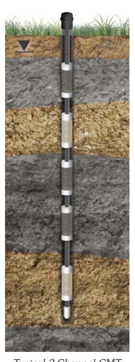
Typical 3-Channel CMT Installation in Overburden with Bentonite and Sand Cartridges

Saves Cost – through reduced permitting and drilling costs; and because narrow tubes allow smaller purge volumes, reduced disposal costs, efficient low flow sampling and rapid response to pressure changes, all reduce field time.