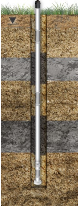
Typical 3 or 7-Channel CMT Installation using Layers of Bentonite and Sand Backfilled from Surface