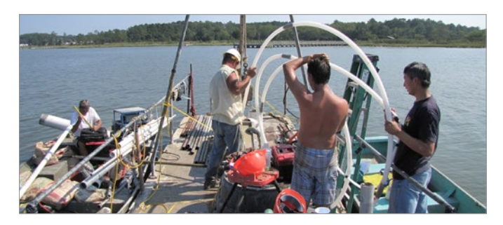
CMT Systems were installed at the bottom of a bay to measure submarine groundwater discharge. Eight 7-Channel CMT Systems were installed, with custom modifications to suit the open water application. Watertight wellheads had to be custom built to allow for sampling from the surface of the bay using a peristaltic pump.