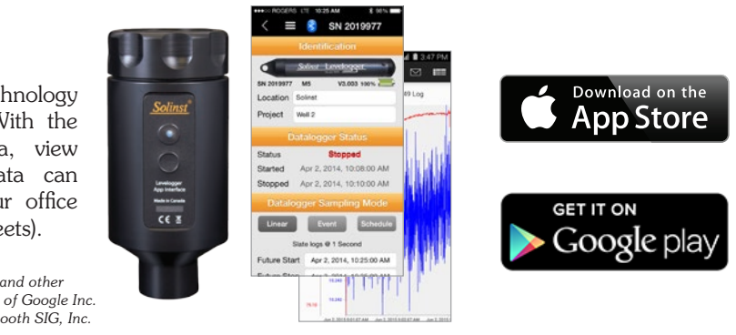
High Quality Groundwater and Surface Water Monitoring Instrumentation

A firmware upgrade will be available from time to time, to allow upgrading of the AquaVent, as new features are added.