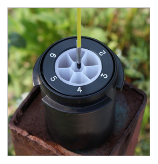
Measure water levels within the narrow channels of a Solinst CMT<sup>®</sup> System.

The 102M Mini Water Level Meter is available in 25 m and 80 ft lengths. There is the choice of the P4 or P10 Probe.